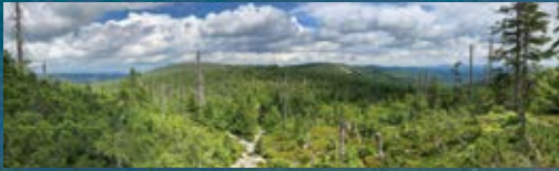
▲ A MODEL ENVIRONMENTAL MEGAPROJECT: BAVARIAN FOREST NATIONAL PARK, 2022